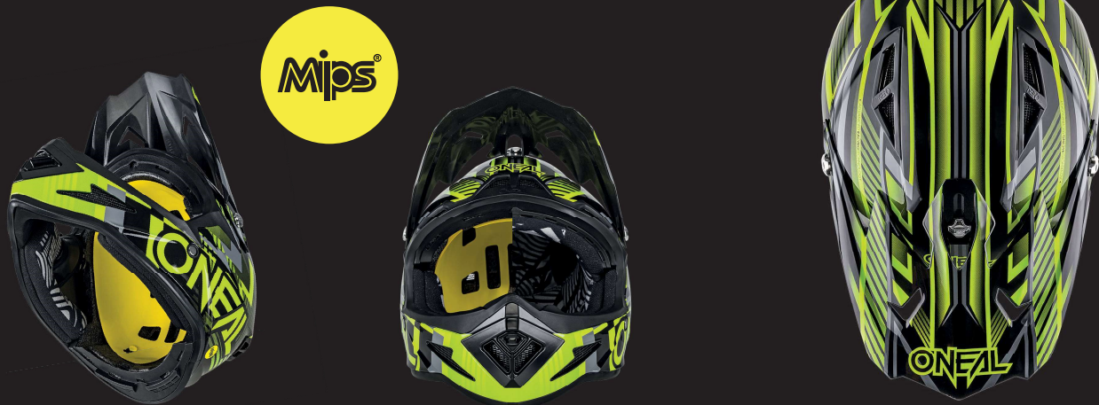
HELMET LINER REMOVED TO SHOW MIPS